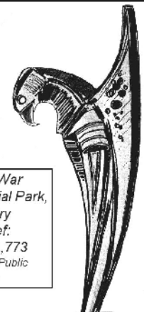
The Kestrel - Canley Ford

Start : War Memorial Park, Coventry Grid Ref: SP 321.773 Parking: Public Car Park